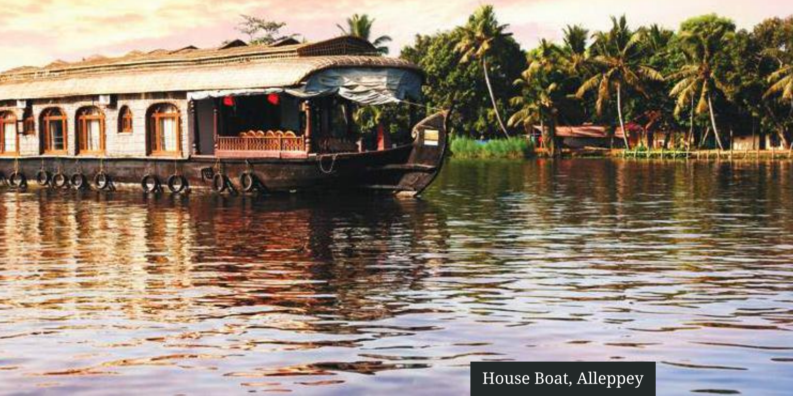
House Boat, Alleppey

Travel to the very heart of Kerala along the Malabar coast. Catch a glimpse of the houseboats and the world renowned backwaters of Alappuzha. Rightfully known as “God’s own Country”, the city of Kochi is not short of exotic attractions. Sporting sights such as the famous Chinese fishing nets, Portuguese architecture as well as a town famous for its jewelry and spices, Kochi is kind to the wanderer. The day ends with the journey back to Bangalore.