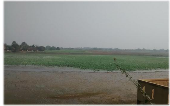
Haliyal Fort – Kille Nisarga Dhama

A 360° panorama view of the Park, the Kille Nisarga Dhama, is shown here