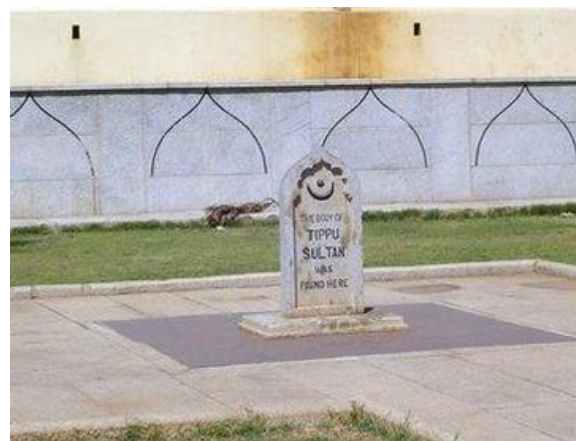
Figure 5: Tipu Sultan's Death Place

The place where Tipu's body was found is close to the northern fringe of the fort. The road from Masjid-e-Ala towards the Water Gate passes by this point. A fenced area with a stone marks the area where his body was found.