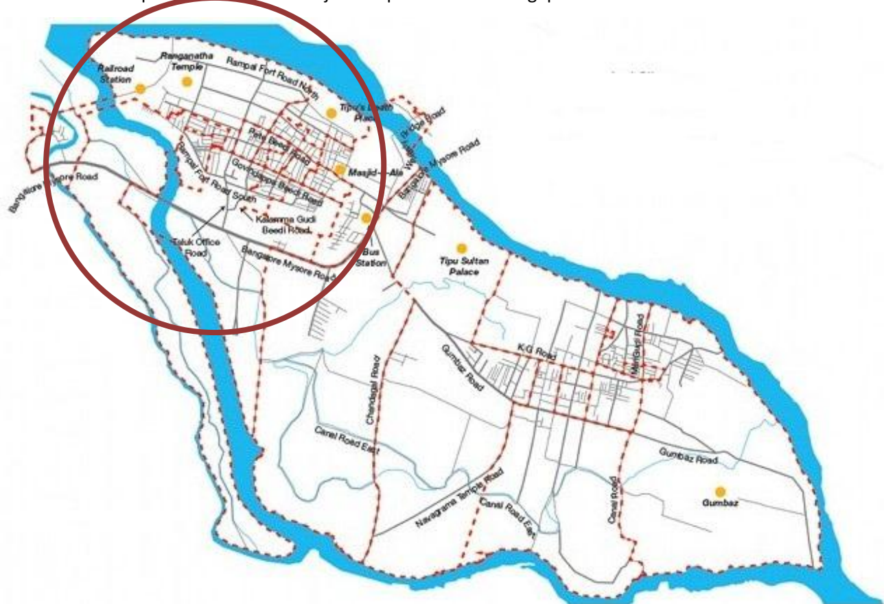
Figure 3: Major Components in Srirangapatna Fort

The map below shows the major components of Srirangapatna Fort: