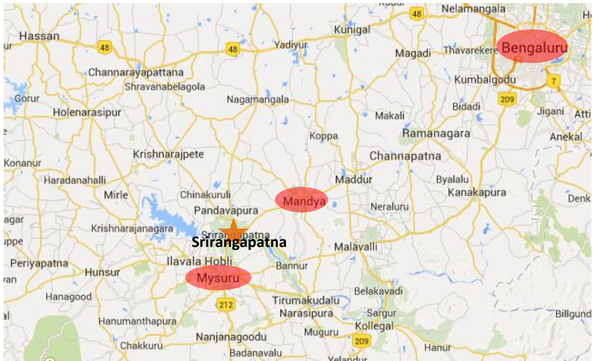
Figure 2: Srirangapatna and neighboring cities