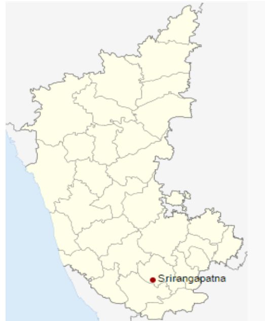
Figure 1: Srirangapatna in Mandya

Cauvery creating the central land mass as an Island. This Island is called Srirangapattana after the presiding deity of the place Sriranganatha. A little upstream, the River Cauvery deviates to west before it creates the island and called Paschimavahini. The fort is situated in the western part of the island. Except Dariya Daulath Bagh, Gumbaz and a few other monuments constructed after 1799 which are situated outside the fort; the major monuments are within the fort area.