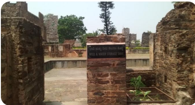
Well and Water Storage Tank