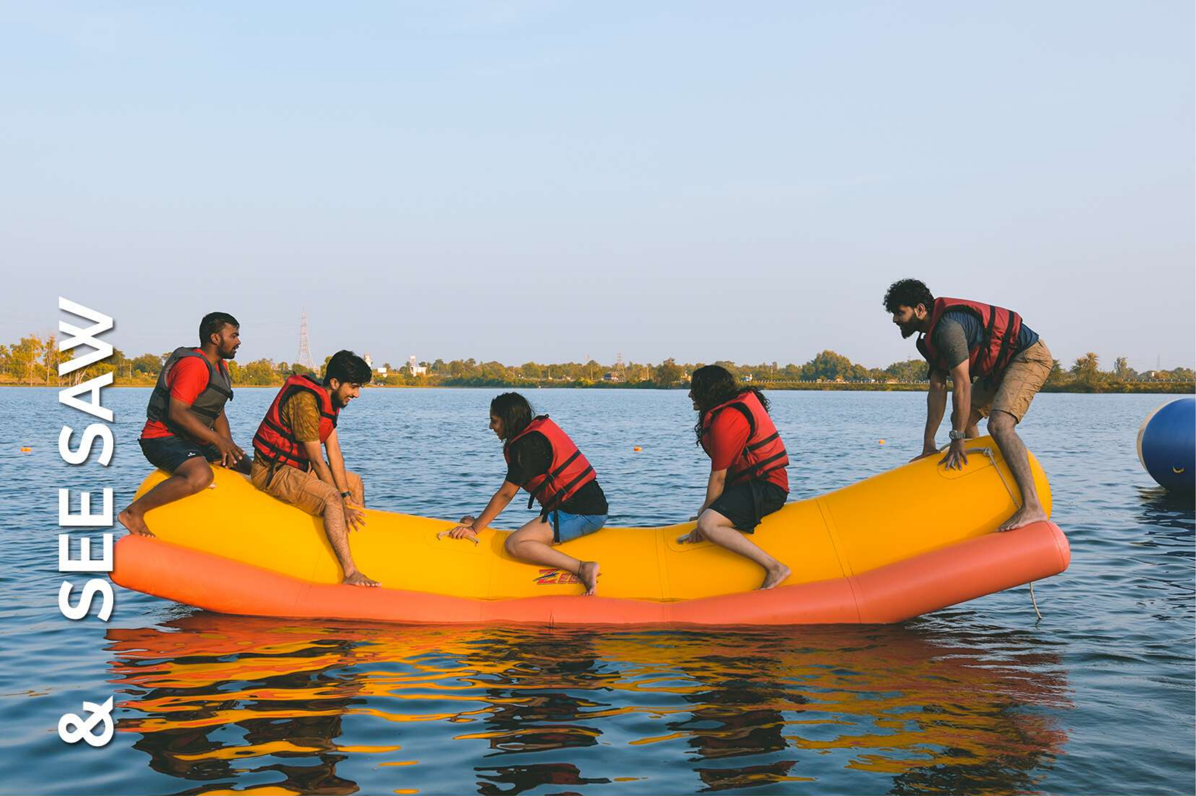
& SEE SAW