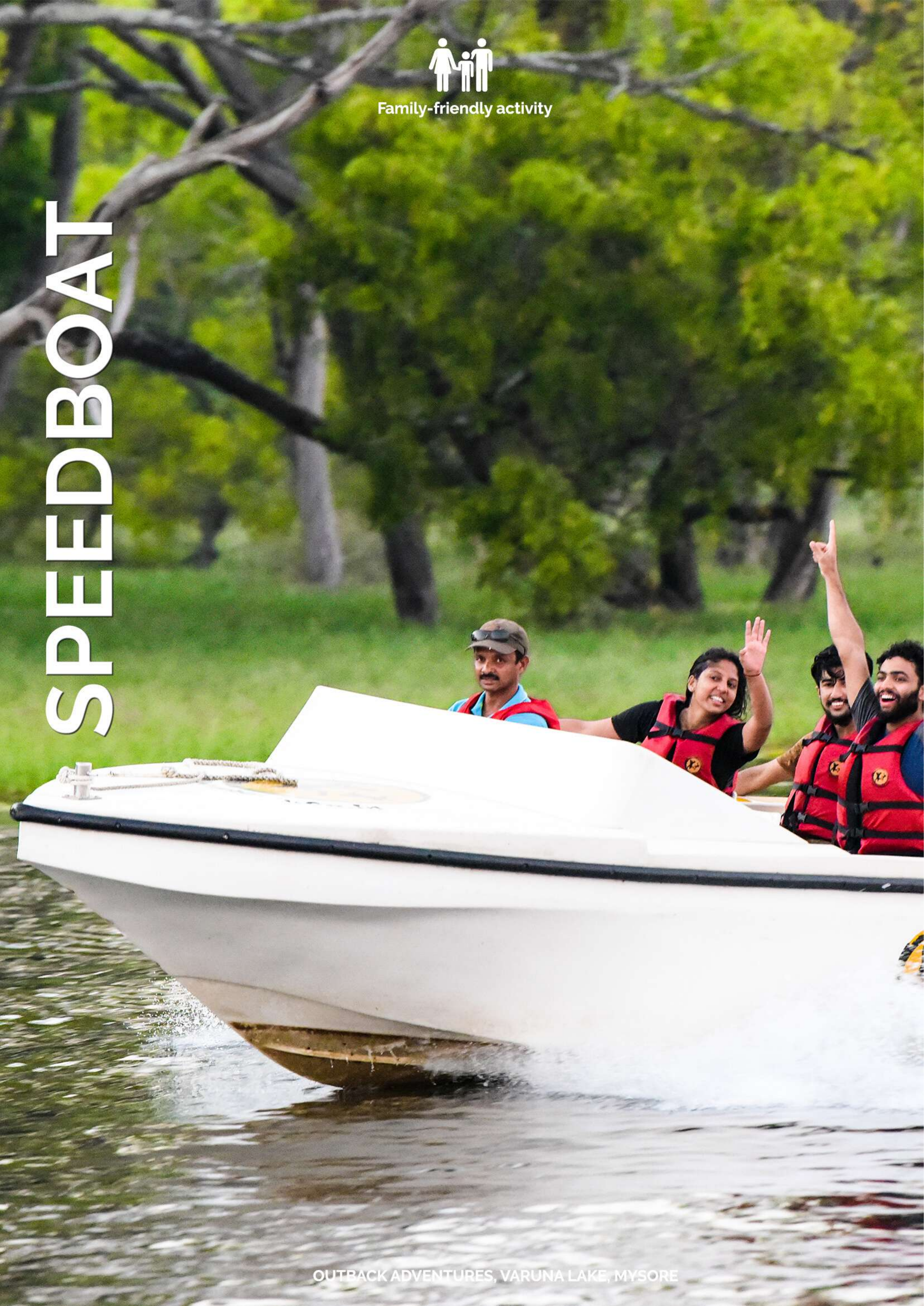
OUTBACK ADVENTURES, VARUNA LAKE, MYSORE

Dont just take our word for it, We are highly rated on-